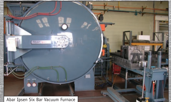
Abar Ipsen Six Bar Vacuum Furnace